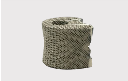
Healthcare Spinal Implant