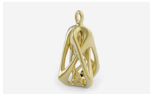
Product Customization Jewelry