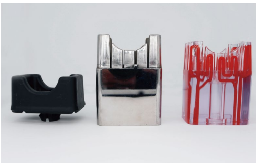
Industrial Manufacturing Conformal Cooling Channel