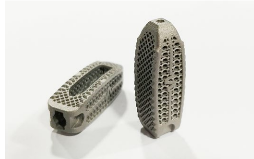
Healthcare Lumbar Interbody Fusion Cage System